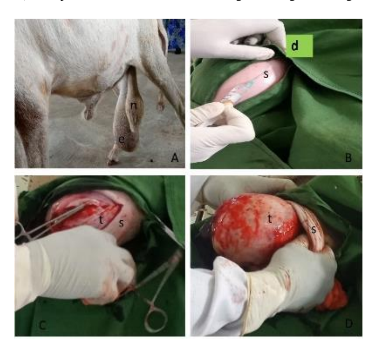
Fig. 1: A: Normal scrotum (n), enlarged scrotum (e). B: Drape (d), anaesthesia (s). C: testis (t), scrotum (s). D: testis (t), scrotum (s).

The animal was prepared for surgery, with surgical site (right scrotum) aseptically prepared, sedation was achieved using xylazine (0.1mg/kg), physical restrain and animal was draped (Fig. 1B). Anesthesia was achieved at the neck of the affected scrotum as well as the spermatic cord using 2% lidocaine hydrochloride. A linear incision was made on the scrotum exposing the testis, the tunic was also incised (Fig. 1C; 1D), however, could not be easily separated from its visceral surface, due to adhesions., caused by testicular injury closed to the scrotal septum (Fig. 2A; 2B) The spermatic cord was exteriorized, ligated using double figure eight suture, with chromic catgut size-2.